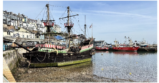
The Golden Hinde replica

Our next stop was Totnes; this is a small market town that has consistently been named in the world's "Funkiest Towns" list and is set on the banks of the River Dart with its own Steamer quay. The main street in the town rises steeply from the river to Totnes Castle and there are a variety of shops and cafes housed in historic 16 th and 17 th Century buildings. Our group split up and took off in different directions having been guided by the large town map at our coach stop some heading for the high street others for the riverbank.