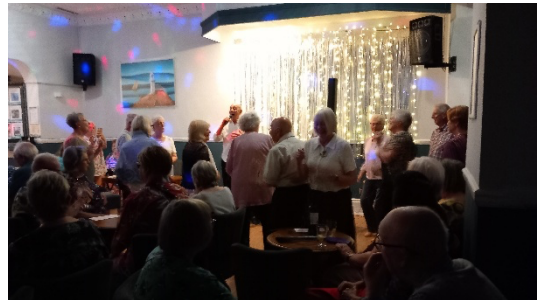
Evening entertainment in the hotel

On a bright sunny Saturday morning, under the banner of Alfa Holidays, a group of LenARA members set off on a tour entitled "South Devon Delights". The journey to Torquay and the Metropole Hotel was uneventful and we made good time arriving at approximately 4 pm. We soon discovered that our hotel was a warren of passages and stairways, but luckily our cases were delivered to our rooms. The rooms were very good, looked as though they had been recently refurbished and the bathrooms spotless. The food was ok, better than other Alfa hotels we have visited, although I would say the chef had used a little poetic licence with some of his menus. There was of course the obligatory Bingo each evening with I believe good cash prizes and also a variety of vocalists and an organist for the dancers in our group to strut their stuff.