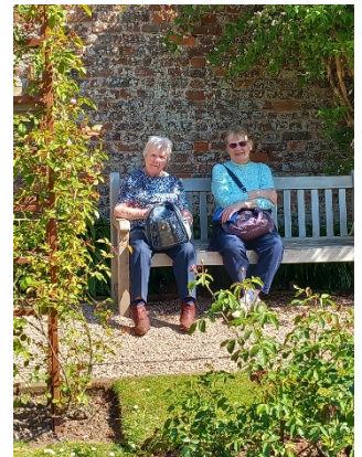
Relaxing in the gardens of Cockington Village

The next day our trip took us to Plymouth and Buckfast Abbey. In the morning we were dropped off by the harbour close to the Barbican where once again everyone disappeared in different directions to do their own thing.